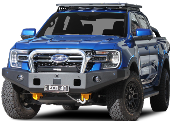
Shown with removable centre hoop.

Impact protection is just one of the benefits of this eye-catching single Hoop Winch Bar. The vehicle's front parking sensors and sonar are relocated into the Winch Bar channel so you can choose to keep the hoop affixed, or remove, and still retain full functionality of these important safety features. Functional in design and manufactured in Australia to suit our harsh Australian conditions. We're so confident about our alloy Winch Bars that we offer a lifetime warranty.