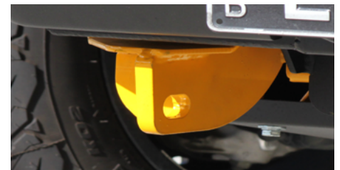
RATED RECOVERY POINTS