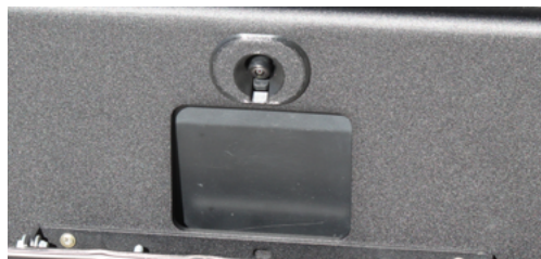
CAMERA & SONAR RELOCATION KIT