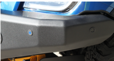
ACCOMMODATES UP TO 6 OEM SENSORS